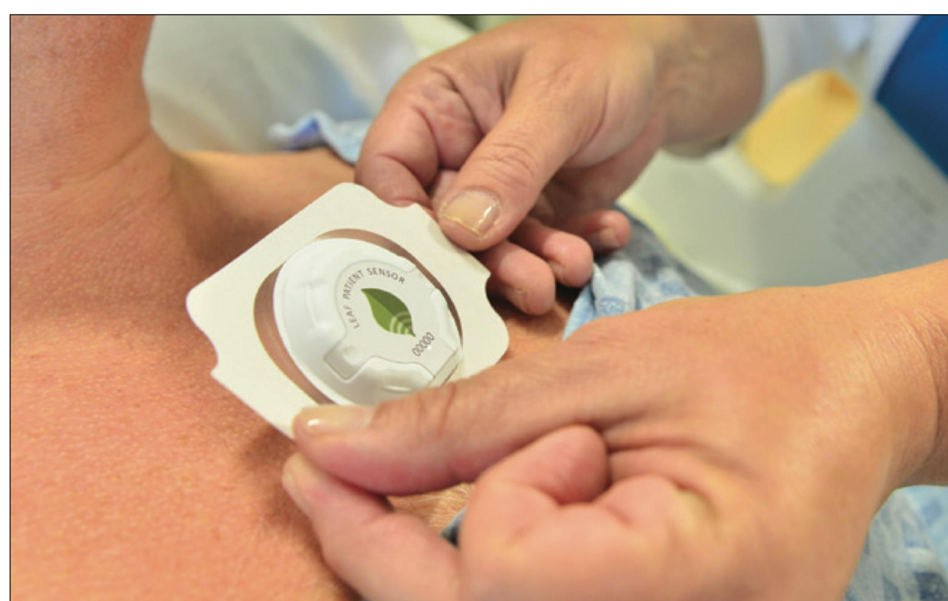
A sensor is applied to a patient's upper torso. The sensor continuously monitors the patient's movement and position. Sensor data is wirelessly communicated through a network of relay antennas and viewable on computers, TVs, and mobile devices.