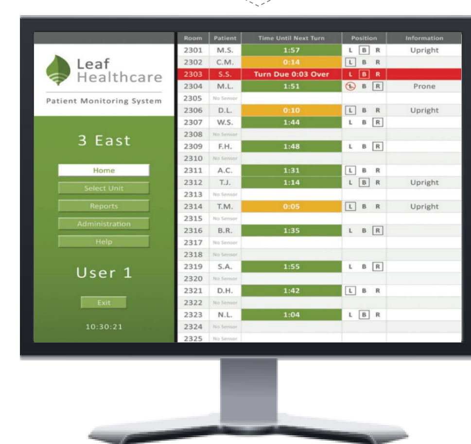
A user-interface displays patient position and turn history.